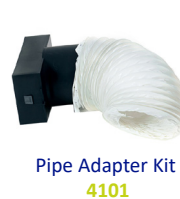
Pipe Adapter Kit 4101