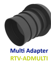
Multi Adapter RTV-ADMULTI