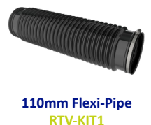
110mm Flexi-Pipe RTV-KIT1