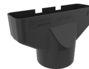
Standard Adapter RTV-ADS