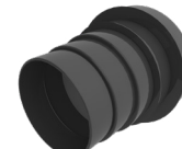
Multi Adapter RTV-ADMULTI