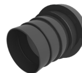
Multi Adapter RTV-ADMULTI